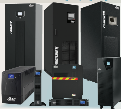
UPS & Emergency Lighting